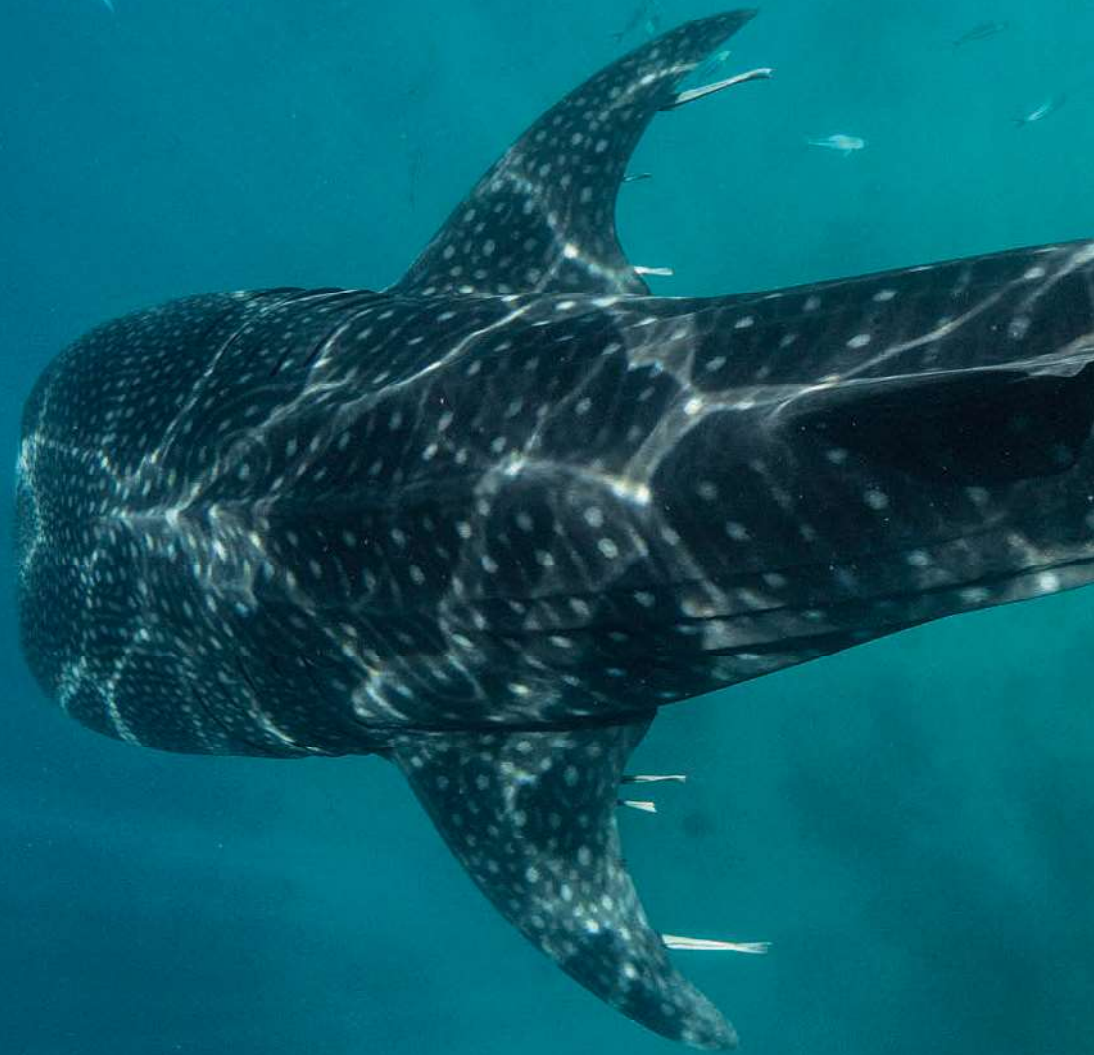
IMAGE: A huge Whale Shark swims below us.