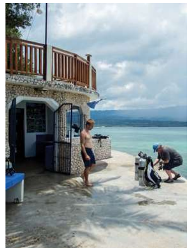
IMAGES Top: Sunset before the night dive. Left: A squid hovers above us as we dive the Moalboal coastline. Above: Setting up the equipment at the dive shop.